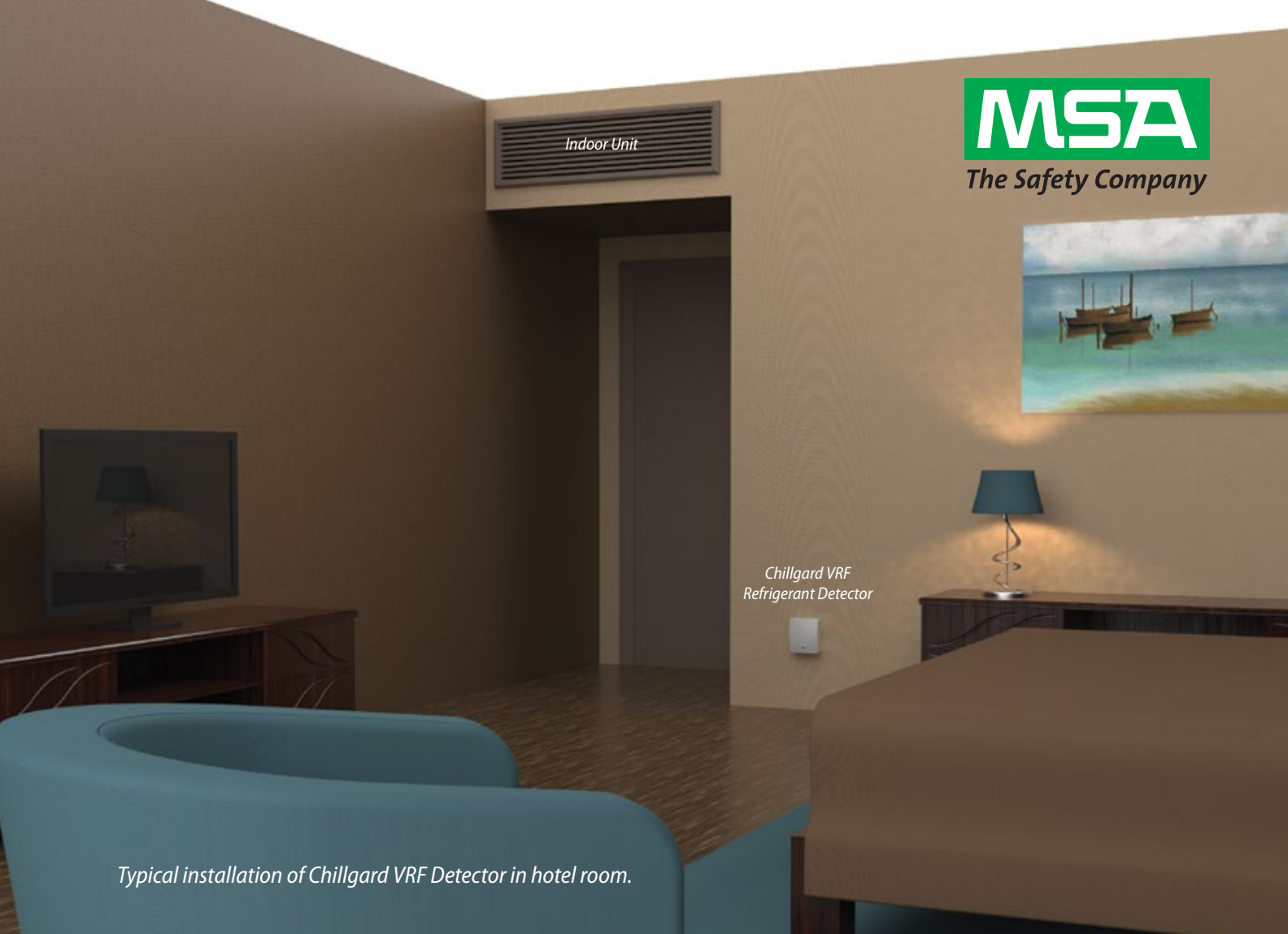
Typical installation of Chillgard VRF Detector in hotel room.